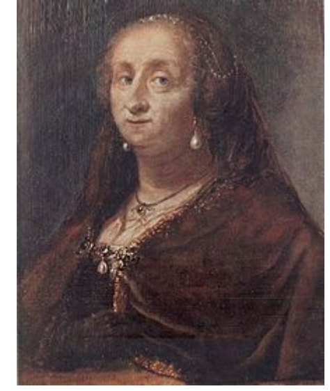
Christina in her later years

She is over sixty years of age, very small of stature, exceedingly fat, and corpulent. Her complexion and voice and face are those of a man. She has a big nose, large blue eyes, blonde eyebrows, and a double chin from which sprout several tufts of beard. Her upper lip protrudes a little. Her hair is a light chestnut colour, and only a palms breadth in length; she wears it powdered and standing on end, uncombed. She is very smiling and obliging. You will hardly believe her clothes: a man's jacket, in black satin, reaching to her knees, and buttoned all the way down; a very short black skirt, and men's shoes; a very large bow of black ribbons instead of a cravat; and a belt drawn tightly under her stomach, revealing its rotundity all too well.<sup>[68]</sup>