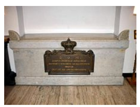
Christina's sarcophagus in the extensive papal crypt at the Vatican

Christina had asked for a simple burial in the <u>Pantheon, Rome</u>, but the pope insisted on her being displayed on a lit de parade for four days in the Riario Palace. She was embalmed, covered with white <u>brocade</u>, a silver mask, a gilt crown, and a scepter. "The Queen wore a thin mantle, decorated with hundreds of crowns and fur bordered with ermine, under this a splendid garment in two pieces, thin gloves and drawers of knitted silk and a pair of elegant textile bootees".<sup>[133]</sup> In similar fashion to the popes, her body was placed in three coffins – one of cypress, one of lead and finally one made of oak. The funeral procession on 2 May led from <u>Santa Maria in</u> <u>Vallicella to St. Peter's Basilica</u>, where she was buried within the <u>Grotte Vaticane</u> – one of only three women ever given this honor (the other two being <u>Matilda of Tuscany</u> and <u>Maria Clementina</u> <u>Sobieska</u>). Her intestines were placed in a high urn.<sup>[q]</sup>