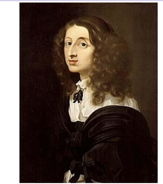
Portrait by <u>Sébastien Bourdon</u>, who exaggerated her eyes.<sup>[1]</sup>