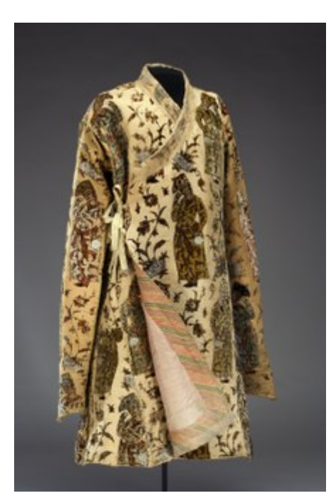
Persian coat owned by Christina, probably woven under <u>Shah Abbas</u> II's Government (1586–1628).

HistoricalaccountsofChristinaincluderegularreferencetoherphysical