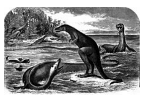
Illustration plate to Cope's 1870 description of several reptiles, including an improperly reconstructed Elasmosaurus (foreground)