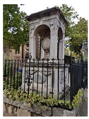
Sloane's monument at Chelsea Old Church

On his death he bequeathed<sup>[1]</sup> his books, manuscripts, prints, drawings, flora, fauna, medals, coins, seals, cameos and other curiosities to the nation, on condition that Parliament should pay his executors £20,000, far less than the value of the collection, estimated at £80,000 or greater by some sources and at over £50,000 by others.<sup>[31][38]</sup> The bequest was accepted on those terms by an act passed the same year, and the collection, together with George II's royal library, and other objects.<sup>[18]</sup> A significant proportion of this collection was later to become the foundation for the Natural History Museum. When Sloane wrote his will not only did he say he wanted to sell his work to the Parliament for 20,000 pounds, he also stated that he wanted his work to be seen by anyone who wanted to see it.<sup>[39]</sup> The Curators thought that only scholars and the upper class were allowed to see the collection. They weren't comfortable with the idea that the lower class was