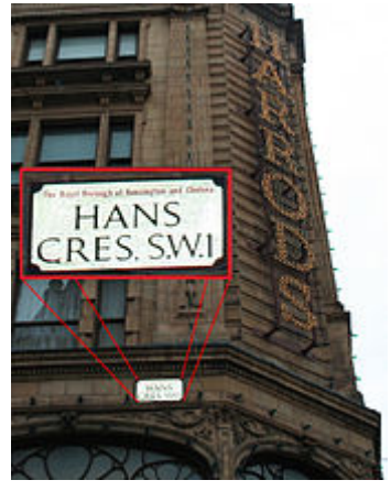
Hans Crescent street-sign on <u>Harrods</u> building, Knightsbridge