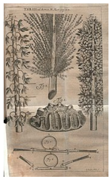
Illustration from critique of the first volume of A voyage to the islands Madera, Barbados, Nieves, S. Christophers and Jamaica, published in <u>Acta</u> Eruditorum, 1710

salt to make them smart; at other times their masters will drip melted wax on their skins, and use very exquisite torments." [24]