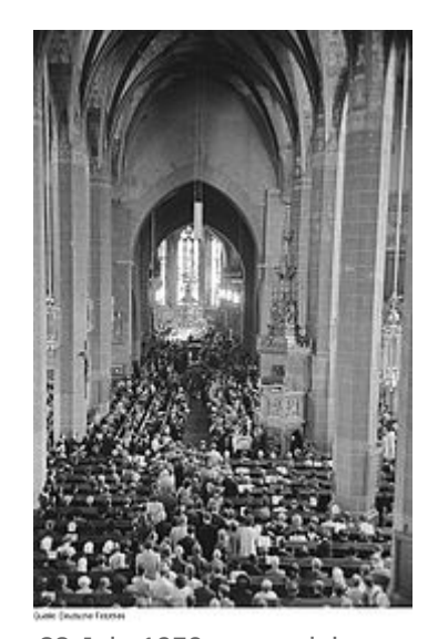
28 July 1950: memorial service for Bach in Leipzig's Thomaskirche, on the 200th anniversary of the composer's death

Bach's music features three times—more than that of any other composer—on the <u>Voyager Golden Record</u>, a gramophone record containing a broad sample of the images, common sounds, languages, and music of Earth, sent