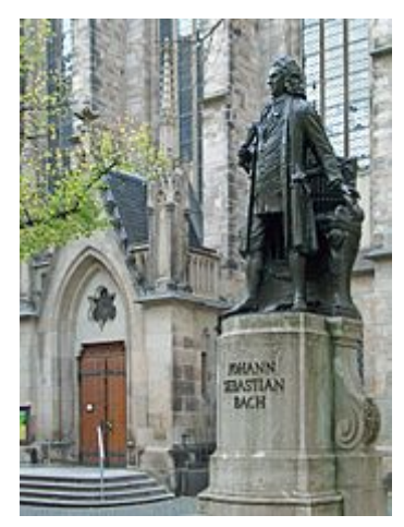
1908 Statue of Bach in front of the Thomaskirche in Leipzig

A significant development in the later part of the 20th century was the momentum gained by the <u>historically informed performance</u> practice, with forerunners such as <u>Nikolaus Harnoncourt</u> acquiring prominence by their performances of Bach's music. His keyboard music was again performed more on the instruments Bach was familiar with, rather than on modern pianos and 19th-century romantic organs. Ensembles playing and singing Bach's music not only kept to the instruments and the performance style of his day but were also reduced to the size of the groups Bach used for his