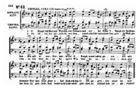
"O Haupt voll Blut und Wunden": the four-part chorale setting as included in the St. Matthew Passion

Four-part harmonies predate Bach, but he lived during a time when modal music in Western tradition was largely supplanted in favour of the tonal system. In this system a piece of music progresses from one chord to the next according to certain rules, each chord being characterised by four notes. The principles of four-part harmony are found not only in Bach's four-part choral music: he also prescribes it for instance for the figured bass accompaniment. The new system was at the core of Bach's style, and his compositions are to a large extent considered as laying down the rules for the evolving scheme that would dominate musical expression in the next centuries. Some examples of this characteristic of Bach's style and its influence: