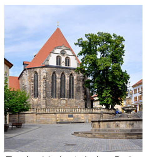
The church in Arnstadt where Bach had been the organist from 1703 to 1707. In 1935 the church was renamed to "Bachkirche".

By the end of the 20th century, more classical performers were gradually moving away from the performance style and instrumentation that were established in the romantic era: they started to perform Bach's music on period instruments of the baroque era, studied and practised playing techniques and tempi as established in his time, and reduced the size of instrumental