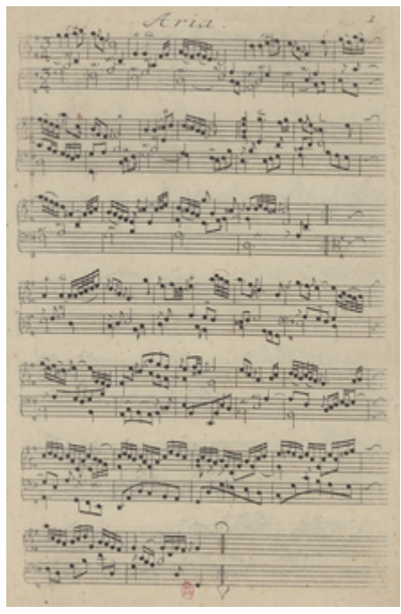
"Aria" of the Goldberg Variations, showing Bach's use of ornaments

Bach wrote virtuoso music for specific instruments as well as music independent of instrumentation. For instance, the <u>sonatas and partitas for solo violin</u> are considered the pinnacle of what has been written for this instrument, only within reach of accomplished players. The music fits the instrument, pushing it to the full scale of