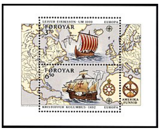
Discovery of America , a postage stamp from the Faroe Islands which commemorates both Leif Erikson and Christopher Columbus

Leif's successful expedition in Vinland encouraged other Norsemen to also make the journey, and the Norse became the first Europeans to colonize the area. In the end there were no permanent Norse settlements, although sporadic voyages at least to Markland for forages, timber and trade possibly lasted for centuries. [46][47] The casual tone of references to these areas may suggest that their discovery was not seen as particularly significant by contemporaries, or that it was assumed to be public knowledge, or both. [25] Knowledge of the Vinland journeys spread around medieval Europe although to what extent is unclear; writers made mention of remote lands to the west, and notably the medieval chronicler Adam of Bremen directly mentions Vinland (c. 1075) based upon reports from the Danes. [note 2] It has been suggested that the knowledge of Vinland might have been maintained in European seaports in the 15th