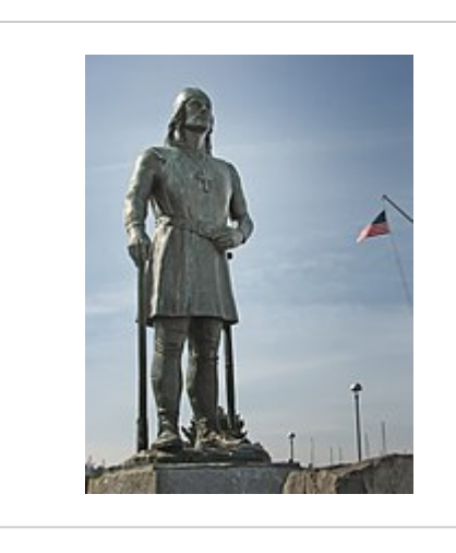
Discovers The Landing of the Vikings by