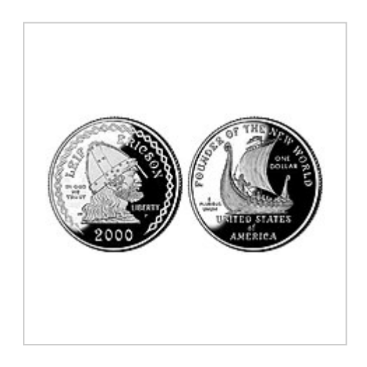
A 'Leif Ericson' proof dollar from the United States, minted in 2000. It reads 'Founder of the New World'