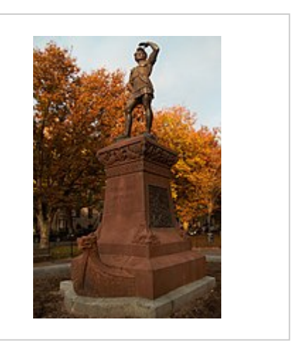
1948-49, near the Minnesota placed in Boston in 1887 State Capitol.